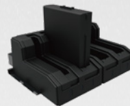
4-bay Battery Charger